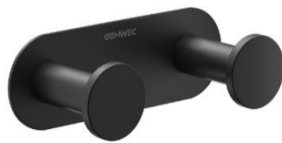
GW05 70 04 03B AISI 304 Matt black