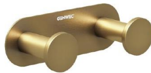
GW05 70 04 07B AISI 304 Brushed gold